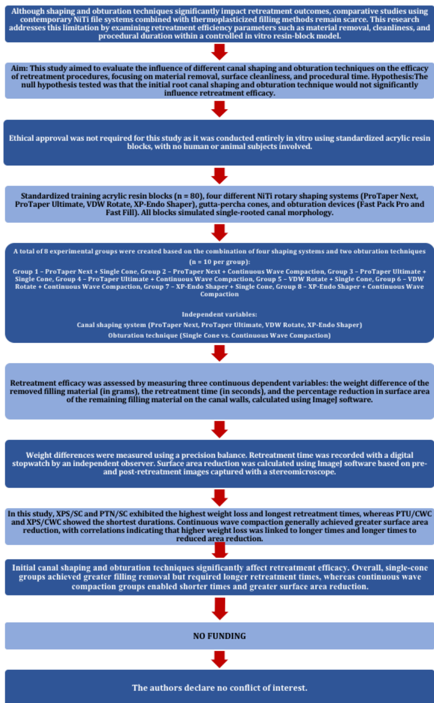
Fig. 1. Preferred reporting items for laboratory studies in endodontology (PRILE 2021) flow chart.

were categorized based on 2 variables: The type of shaping system (PTN, PTU, VR, and XPS) and the obturation technique used (SC or CWC).