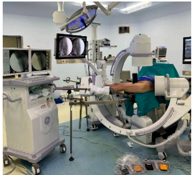
Figure 1. Patient positioning and double fluoroscopy setup prior to surgery.

In FNF procedures, reduction was verified intraoperatively by adjusting the fracture table through internal and external rotation under fluoroscopic guidance. The surgical approach involved a 3-cm incision distal to the trochanter to expose the entry point. Three Kirschner wires were inserted in an inverted triangular configuration along the longitudinal axis of the femoral neck into the femoral head. The position and alignment of the K-wires were confirmed fluoroscopically, after which fracture fixation was achieved by insertion and tightening of three 6.5-mm cannulated screws (Fig. 3). The procedure was completed with wound closure using sutures.